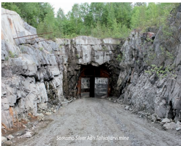
Sotkamo Silver AB's Tailvaljärvi mine

“Finland has emerged as the most exciting exploration country in Europe during the past couple of years”