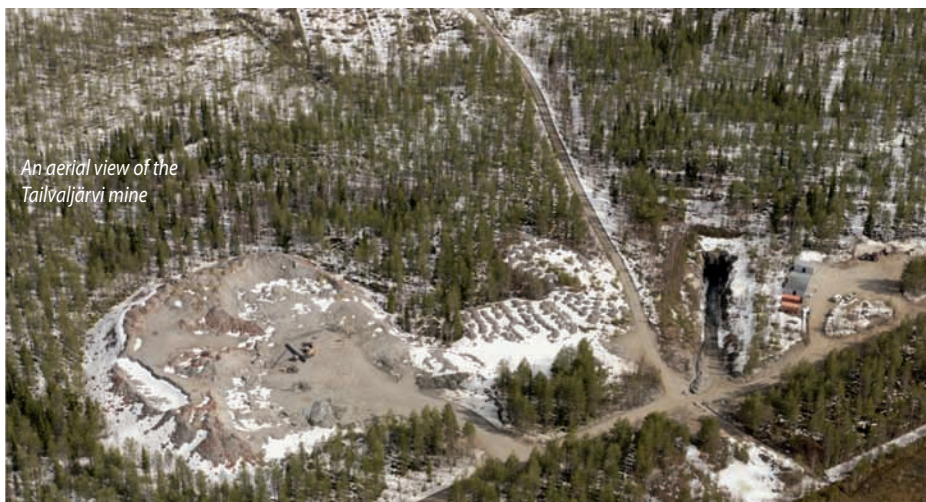
An aerial view of the Tailvaljärvi mine

Angel Mining plc, likewise based in the UK, is planning to re-open the previously-producing Black Angel zinc mine on the west coast of Greenland. The company has also restarted the Nalunaq gold mine in