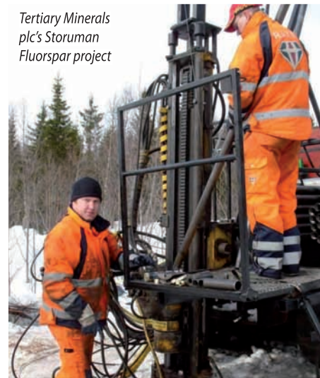
Tertiary Minerals plc's Storuman Fluorspar project

In Greenland, most exploration efforts are concentrated to the west and south coast. All these regions are areas in which every additional economic activity is important and where unemployment is relatively high and the economy stagnant.